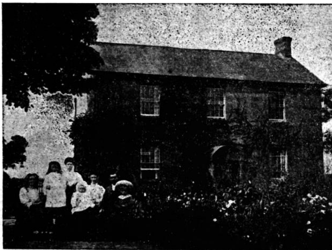
INFIRMARY AND FAMILY GROUP, AT THE UNION SCHOOLS, BLEDLow.